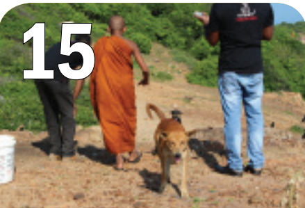
15 SPAY-NEUTER: PULMUDAI 16 Surgeries, 16 Vaccinations Pulmudai