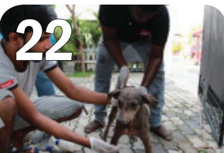
22 MOBILE VETERINARY TREATMENT Providing medical support to injured dogs / pups in a community