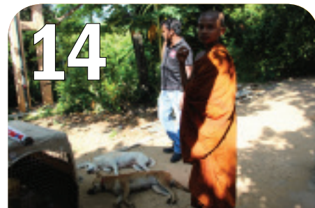
14 SPAY-NEUTER: PULMUDAI 16 Surgeries, 16 Vaccinations Pulmudai