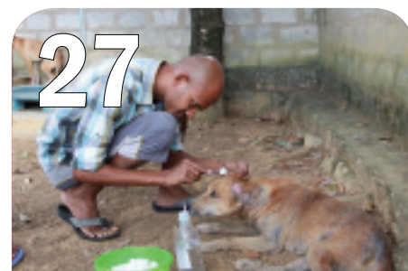
27 HOSPITAL DAY WITH THE EMBARK TEAM Attending to physio, treatment and care at vet.hospitals