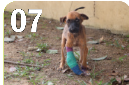
07 RESCUE AND TREATMENT: PUPPY Treatment and Rehabilitation via Partnered Clinics