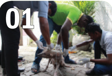
01 MOBILE VETERINARY TREATMENT Medical support to injured dogs / pups in the community