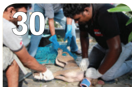
30 SPAY-NEUTER: DAMBULLA Providing medical support to injured dogs / pups in a community