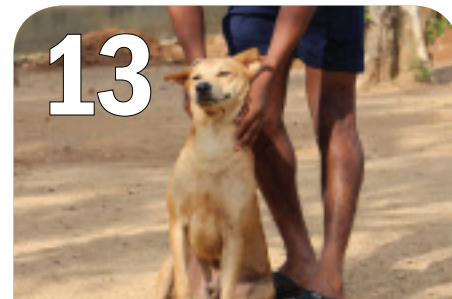
13 SPAY-NEUTER: PULMUDAI 16 Surgeries, 16 Vaccinations Pulmudai