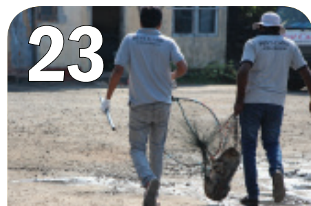
23 SPAY-NEUTER: PANADURA 15 Surgeries, 15 Vaccinations Tyre Factory, Panadura