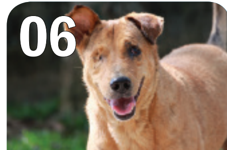
06 HOSPITAL DAY WITH THE EMBARK TEAM Attending to physio, treatment and care at vet.hospitals