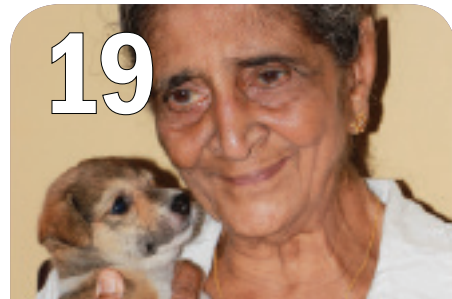
19 VISIT TO THE ST MARTIN'S ELDERS HOME