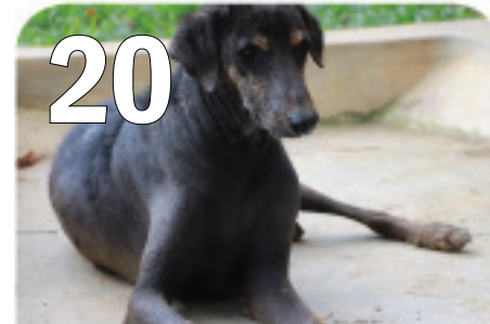
20 HOSPITAL DAY WITH THE EMBARK TEAM Attending to physio, treatment and care at vet.hospitals