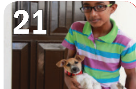
21 Adoption Followup: December Adoptions Volunteers Visit and Monitor Pups in their New Homes