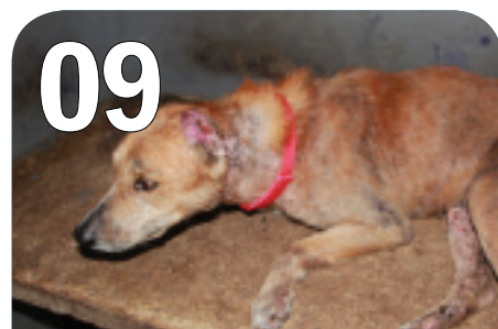
09 HOSPITAL DAY WITH VOLUNTEERS Attending to physio, treatment and care at vet.hospitals