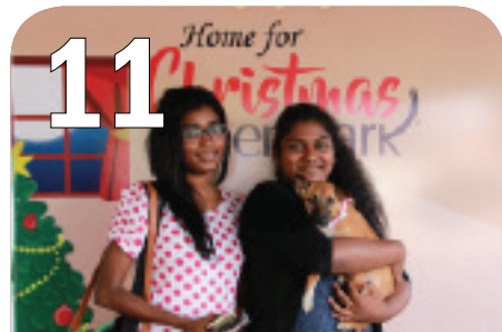
11 COLOMBO PUPPY ADOPTION DAY 20 Rescue-pups rehomed, ODEL Alexandra Place Car Park