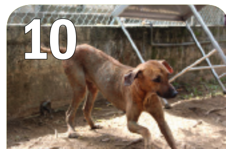
10 RESCUE AND TREATMENT: MOLLY Treatment and Rehabilitation via Partnered Clinics