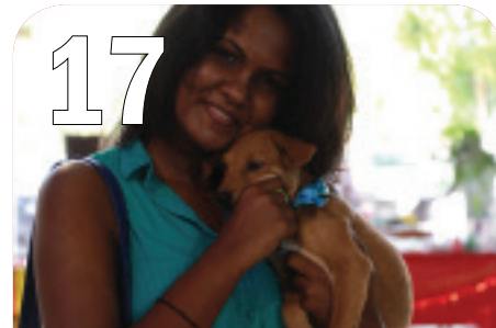
17 JA-ELA PUPPY ADOPTION DAY 15 Rescue-pups rehomed, K-Zone Ja Ela