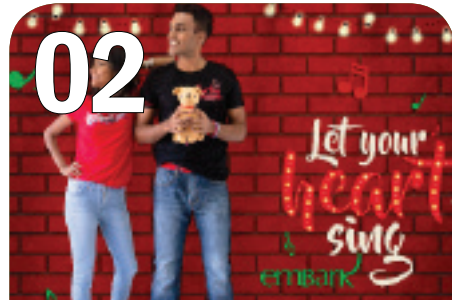
02 EMBARK CHRISTMAS PHOTO SHOOT Photoshoots with our rescued, fostered, or re-homed pooches