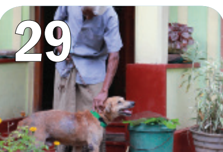
29 RESCUED AND REHOMED: BROWN E Rehoming rescue dogs after treatment and recovery