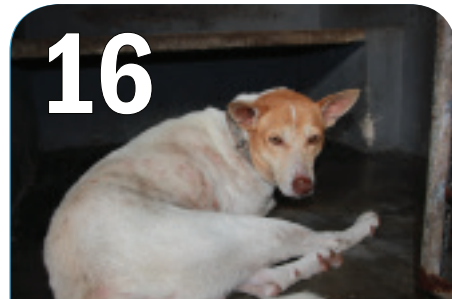
16 RESCUE AND TREATMENT: REX Attending to physio, treatment and care at vet.hospitals