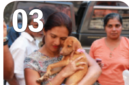
03 KANDY PUPPY ADOPTION DAY 9 Rescue-pups rehomed, KCC Kandy