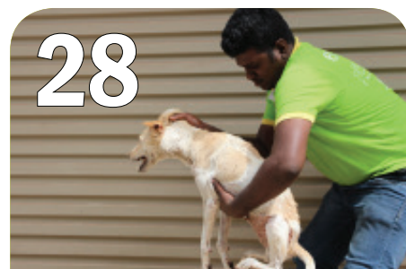
28 RESCUE AND TREATMENT: ARROW Treatment and Rehabilitation via Partnered Clinics